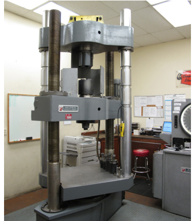
In-house Testing Laboratory Phoenix, AZ